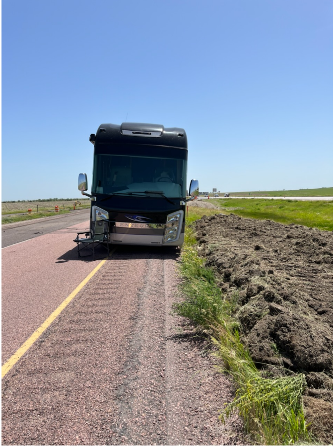
Coach on side of roadside

only 7 hours of sitting on the side of the road questioning the sanity of this chosen lifestyle!