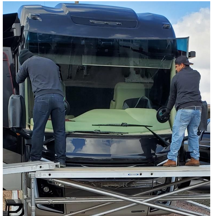
Placing the new windshield was done carefully making sure everything was lined up properly.

Next they removed the old window and cleaned up everything.