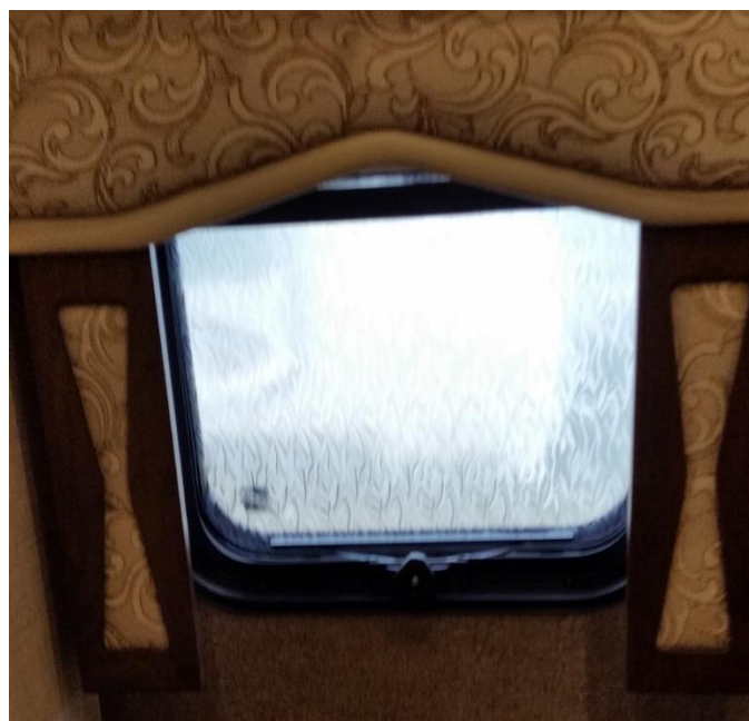
Figure 3 Finished Product

top of the frosting film and position the sticky side on the top of the window. Pull down the backing while holding the top in place making sure to minimize bubbles and wrinkles. Once loosely in place use the squeegee to remove any remaining bubbles then the lint free cloth for a final wipe to make sure everything is smooth and dry. The finished product is shown in figure three.