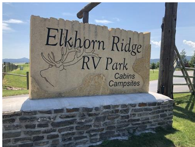
Elkhorn Ridge RV Park