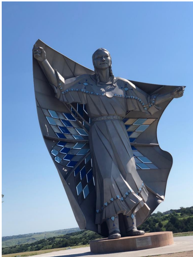
Welcome to South Dakota