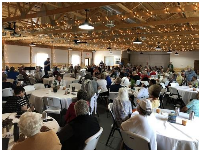
The Guests 01