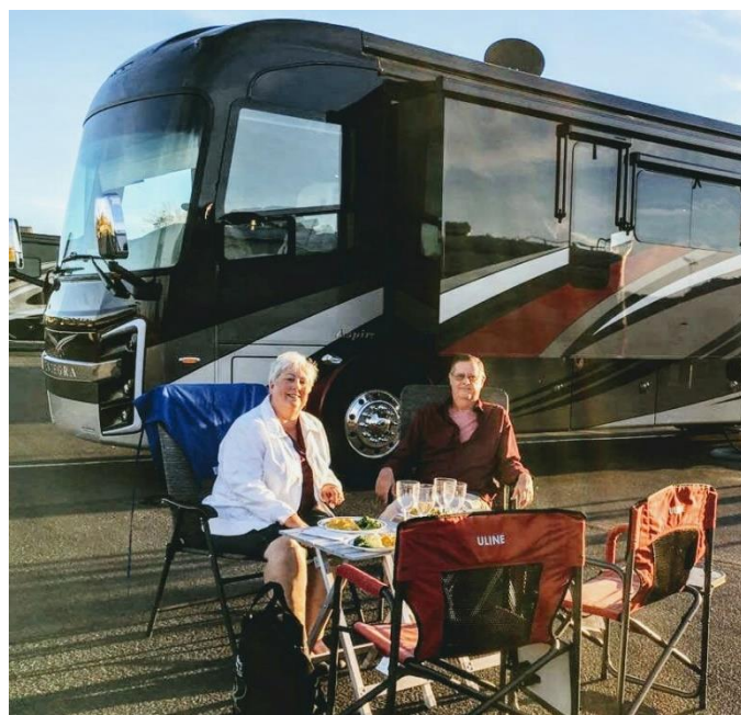
Figure 4 Waiting For Dinner Guests In Yuma, AZ

This summer we have already traveled 4278 miles through 15 states, attended the Spartan Owners Academy Entegra Partners Session, and attended Homecoming 18. There are several more states in our summer plan and as we travel we are always on the lookout for other Entegra owners.