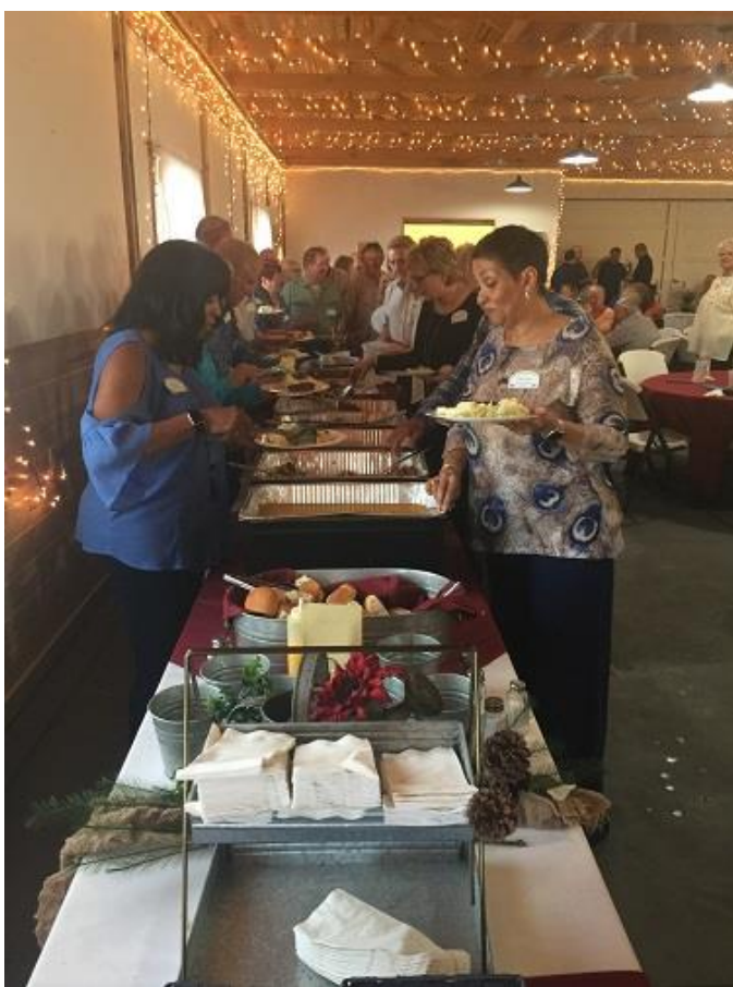
Food and Fun