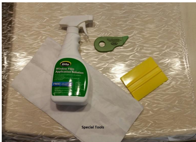
Figure 2 Application Kit

Tools required are a marking device (pencil, pen, sharpie) measuring device (we used a metal ruler), cutting devices (scissors and razer knife), squeegee, and a lint free cloth. We elected to purchase the application kit that included an application fluid (a window cleaner will work). Figure 1 shows the contents of the application kit.