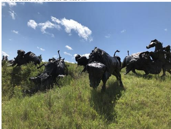
The Buffalo Jump at Tatanka (Lakota for Buffalo)- Kevin Costner's celebratory tribute to the Buffalo...and the Lakota.