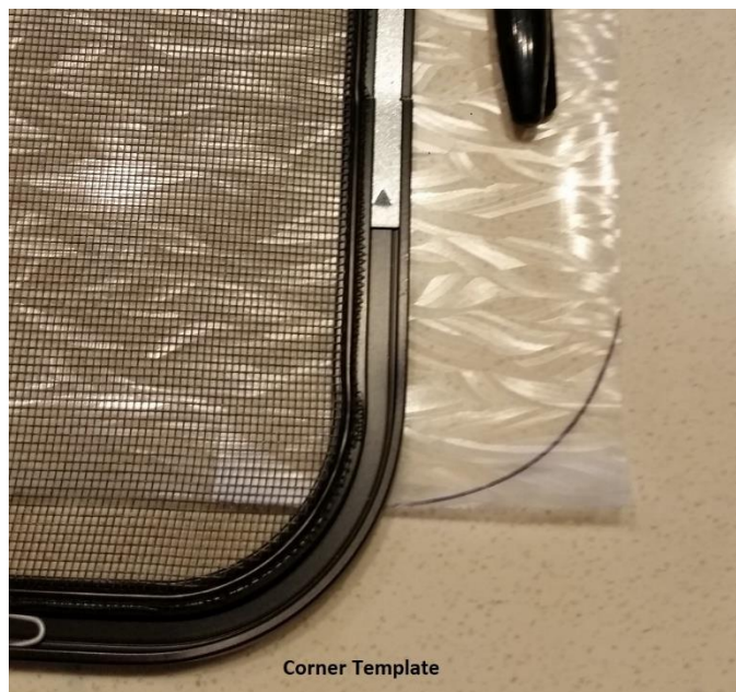
Figure 1 Use Screen as Corner Template

Clean the window glass then use the lint free cloth to pick up any remaining debris. Spray the window with the application solution (this will let you move it around slightly). Remove the backing from the