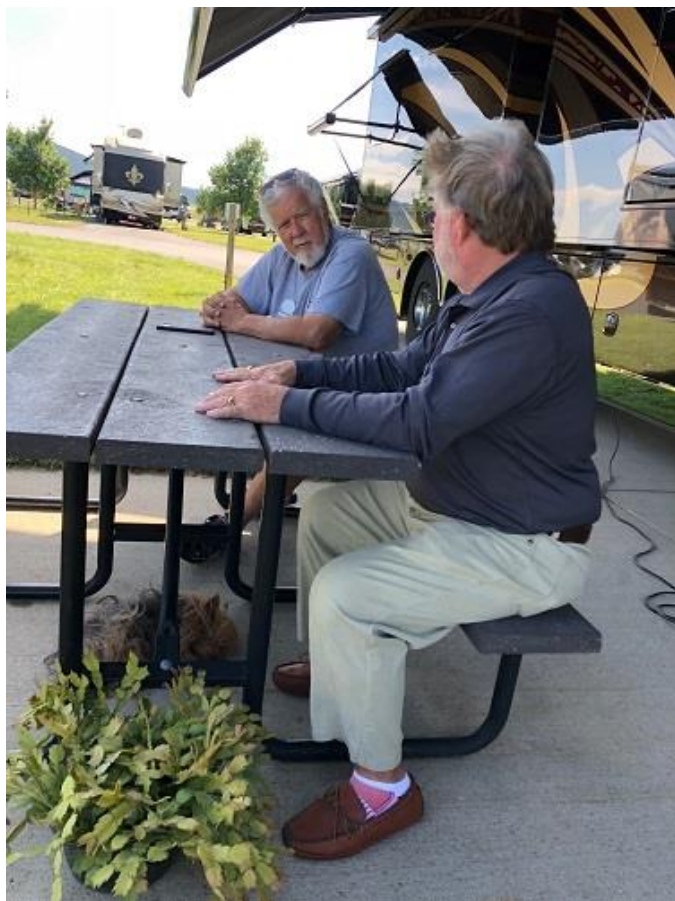
Deep Thoughts and Serious Business