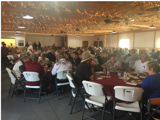
The Guests 02